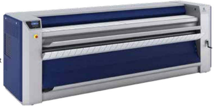
Images shown are a representation of the product only and variations may occur.

Guaranteeing consistent results without interruption